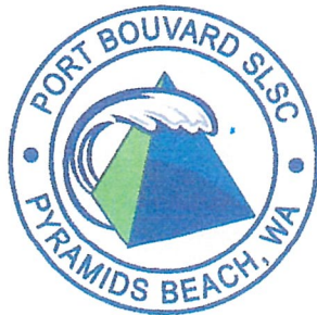
Fig 1a: Common Seal Fig